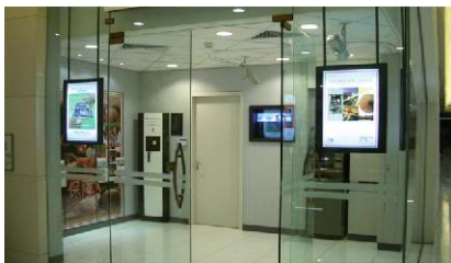
Hanging installation(single side viewing)

To changing the poster quickly and easy, weather snap frame, swing cover or removable cover of your choice.