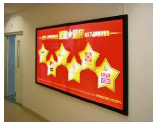
Wall mounting application in MRT station (Max. size 1500mm x 3000mm)