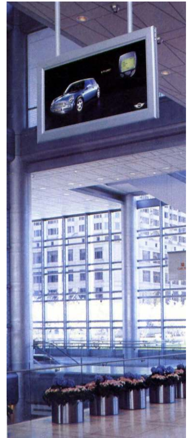
Hanging installation(double side viewing)