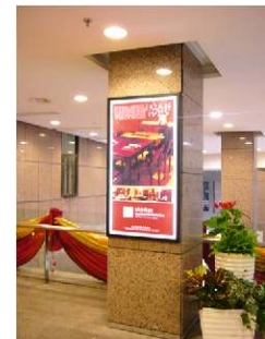
Wall mounting installation